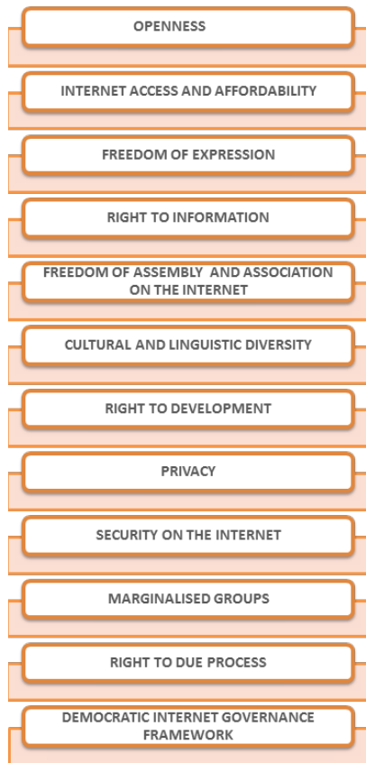
The principles of the Declaration

The second challenge identified was the insufficient and ineffective protection of key political and civil rights online in Africa, including freedom of expression, association and assembly. Increasing numbers of arrests, overly severe penalties and due process abuses were identified as particular issues that needed to be addressed. Although interrelated, these rights were broken down into their composite parts and were incorporated into the Declaration as individual Principles, each representing a fundamental human right.